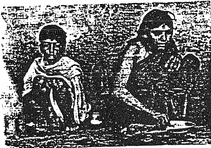
Fig. 1 The daily bhāt meal in a high caste home.

It is this same every day food that is crucial to intercaste relations. The rule of bhāt transfer between castes is simple and clear: High castes may publically serve bhāt to lower castes and not the reverse. A person may receive bhāt from fellow caste members or from members of a caste which he recognizes as higher than his own. Any public failure to observe these restrictions results in loss of caste (the violator must assume the caste of the person whose bhāt , he ate, and his former caste mates will no longer accept his bhāt . 5 Thus in any public, multicaste context where food is served (for example at weddings) Brahman cooks & servers are a necessity. (Fig. 2).