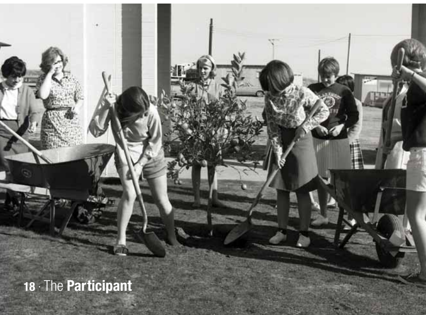
Students plant the tree presented during the College's dedication.

In keeping with Pitzer's spirit of community involvement, the movement which led to the