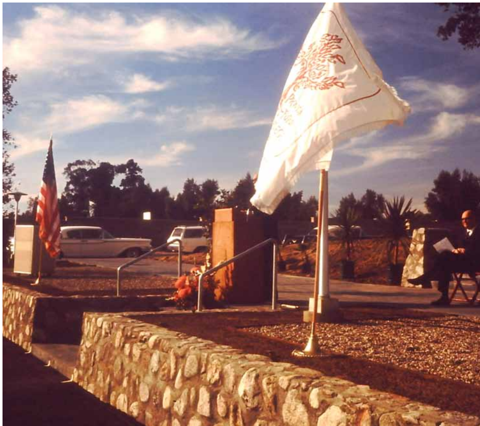
Pitzer flag, 1964.