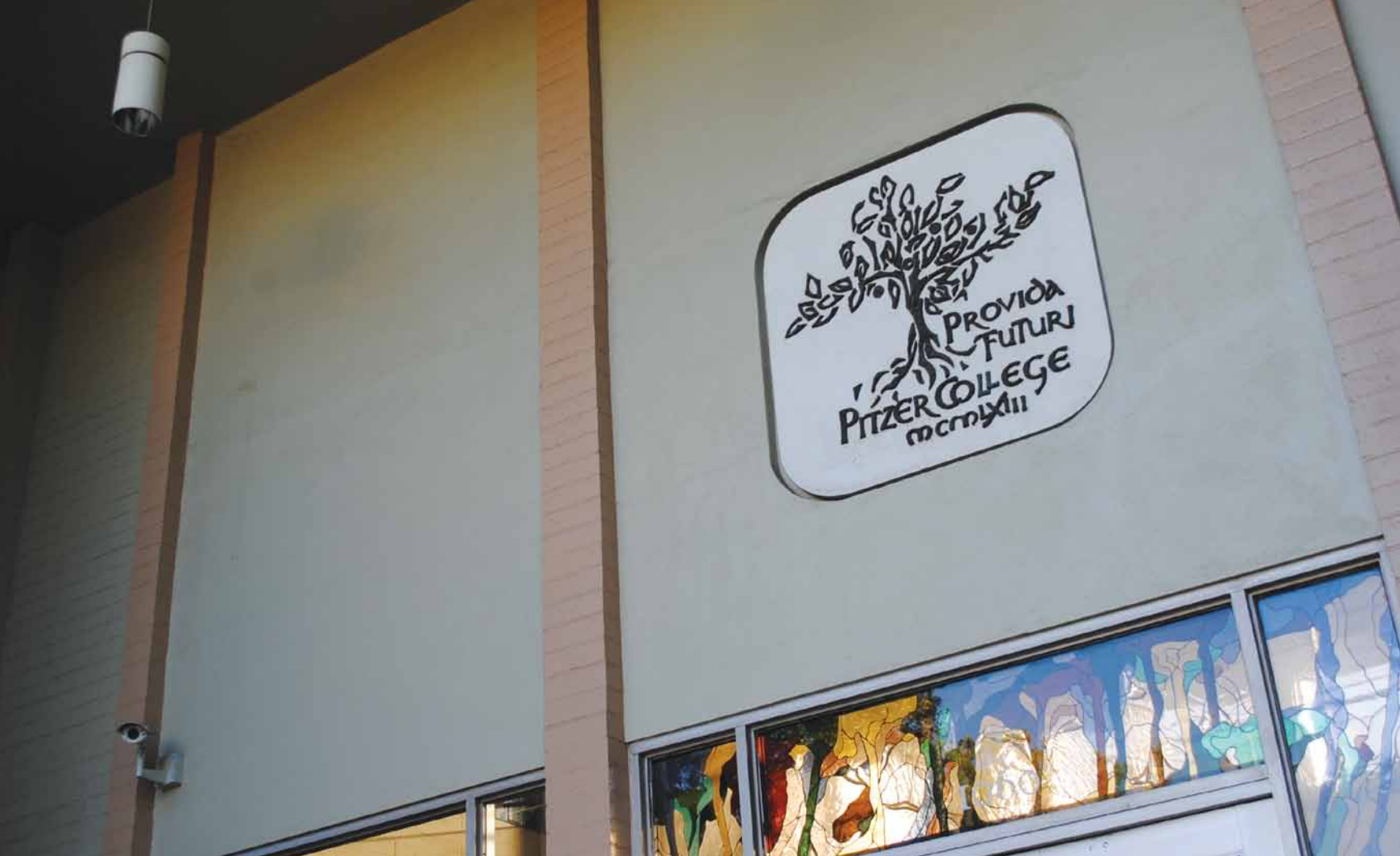
The Pitzer seal on Scott Hall.