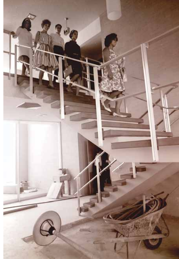
Students in Scott Hall, still under construction, August 15, 1964.