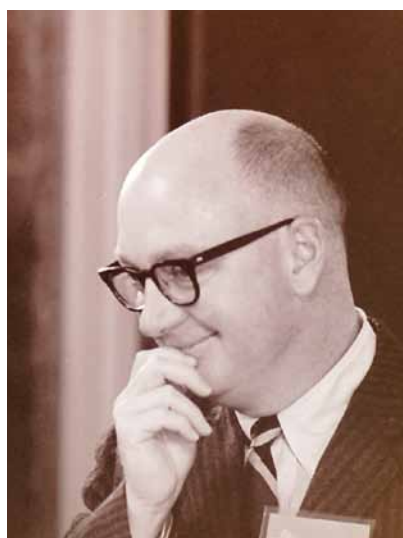
Atherton, September 17, 1965.