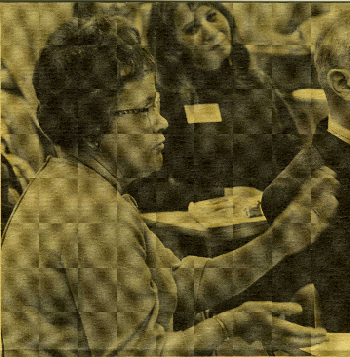
How important is higher education to the woman who does not seek a career outside the home?