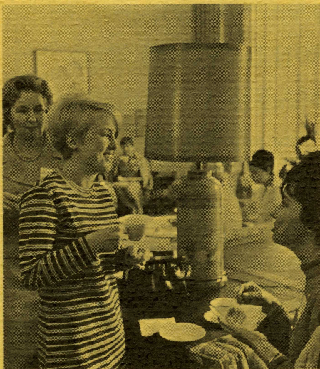
A warming and fortifying first step toward looking into the future.

Following luncheon in Holden and Sanborn courts, small group discussions were held. Using an old and tested method of communicating, parents, students and faculty sat down, squared off, and expressed opinions on such subjects as "Admissions," "Academic Standards," "Curriculum Directions," and "Beyond Pitzer — What Opportunities For Our Graduates?"