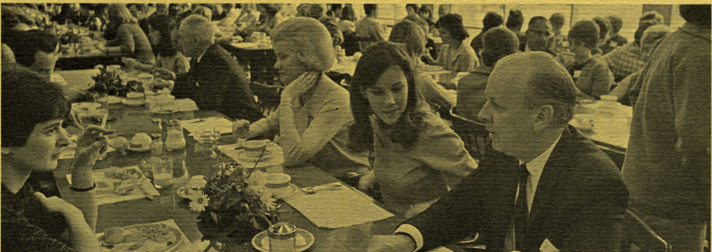
For a rigorous day, sustenance midway