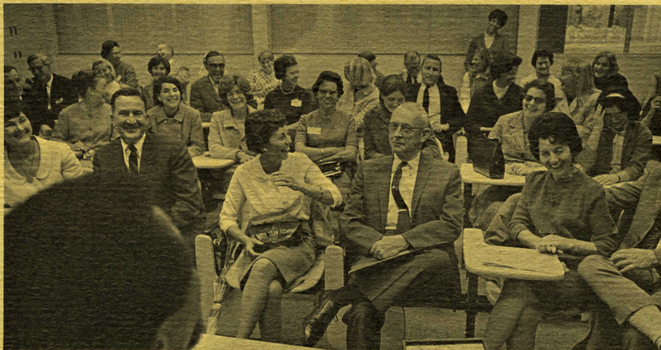
With serious conversation — some laughs