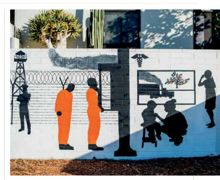
PHOTO: Social commentary is found across campus in the form of powerful murals.