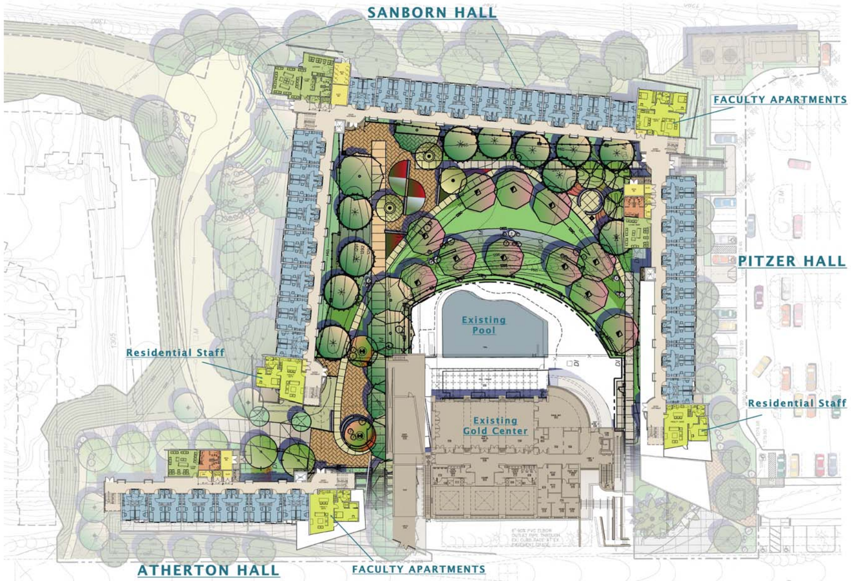
Level Two- Overall Plan