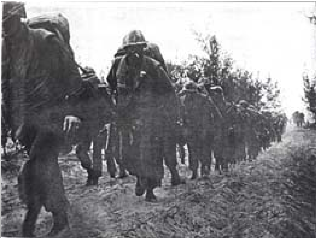
Marching in the 1960s, GI's of South Vietnamese guerrillas, they're fighting some of the old battles. GI's Vietnam, like their white counterparts, to search for information and to fight them in the. They are among some 20,000 Negroes in military and civilian service contributing to their. Negroes 20 who have been recruited to support jobs.