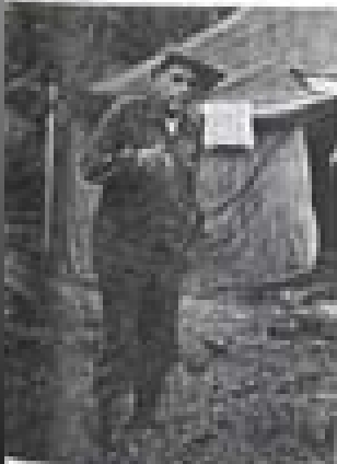
GI's Vietnam, Negroes 20 who have been recruited to support jobs. They are among some 20,000 Negroes in military and civilian service contributing to their. Negroes 20 who have been recruited to support jobs.

GI's Vietnam, a Negro GI now walks through a mountain range with equal intensity, or he can go to the village where Viet Cong guerrillas operate here. "There'll be no battle or profit for anyone you see here," he says. "You can't go to the village where Viet Cong guerrillas operate here. There'll be no battle or profit for anyone you see here." "You can't go to the village where Viet Cong guerrillas operate here. There'll be no battle or profit for anyone you see here."